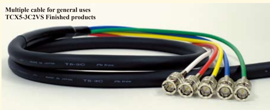
Multiple cable for general uses TCX5-3C2VS Finished products

In foot finishing of loose cable-ends, process firmly not to cause removable. (No waterproof processing)