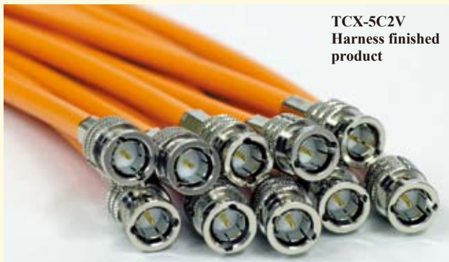
TCX-5C2V Harness finished product