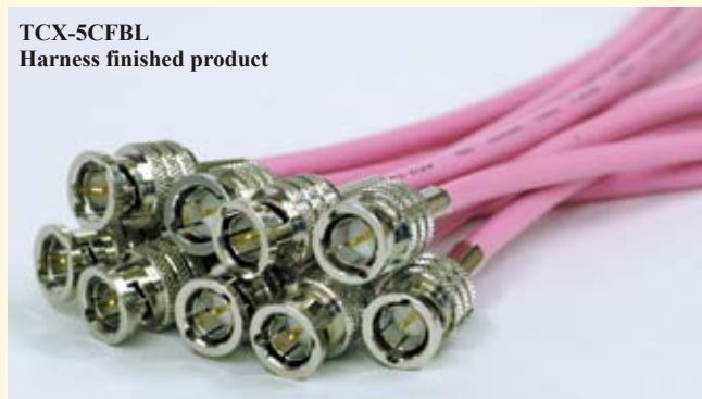
TCX-5CFBL Harness finished product