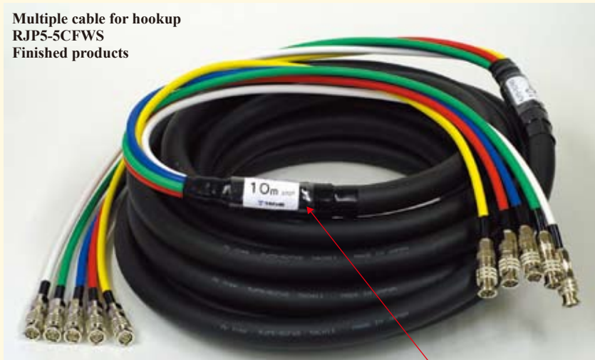
Multiple cable for hookup RJP5-5CFWS Finished products